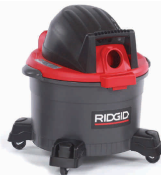
22.5L Wet/Dry Vacuum with accessories